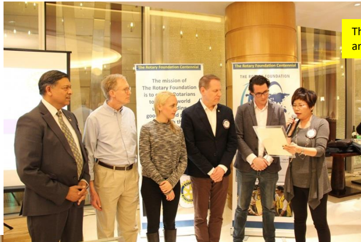
Three inductees and sponsors